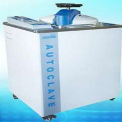
Autoclaves vertical and portable