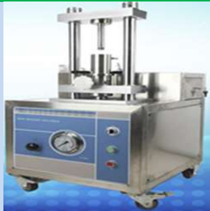
High pressure homogenizers