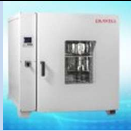
Drying oven different sizes and temperature ranges