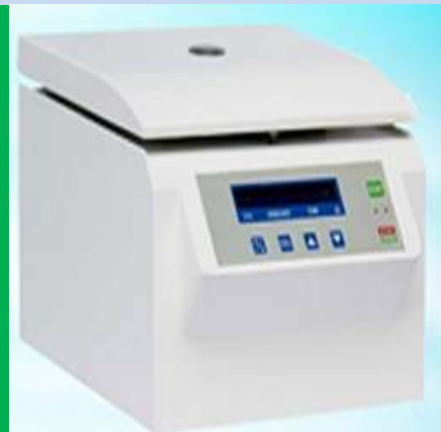
Centrifuge different sizes, speeds, uses, with cooling...